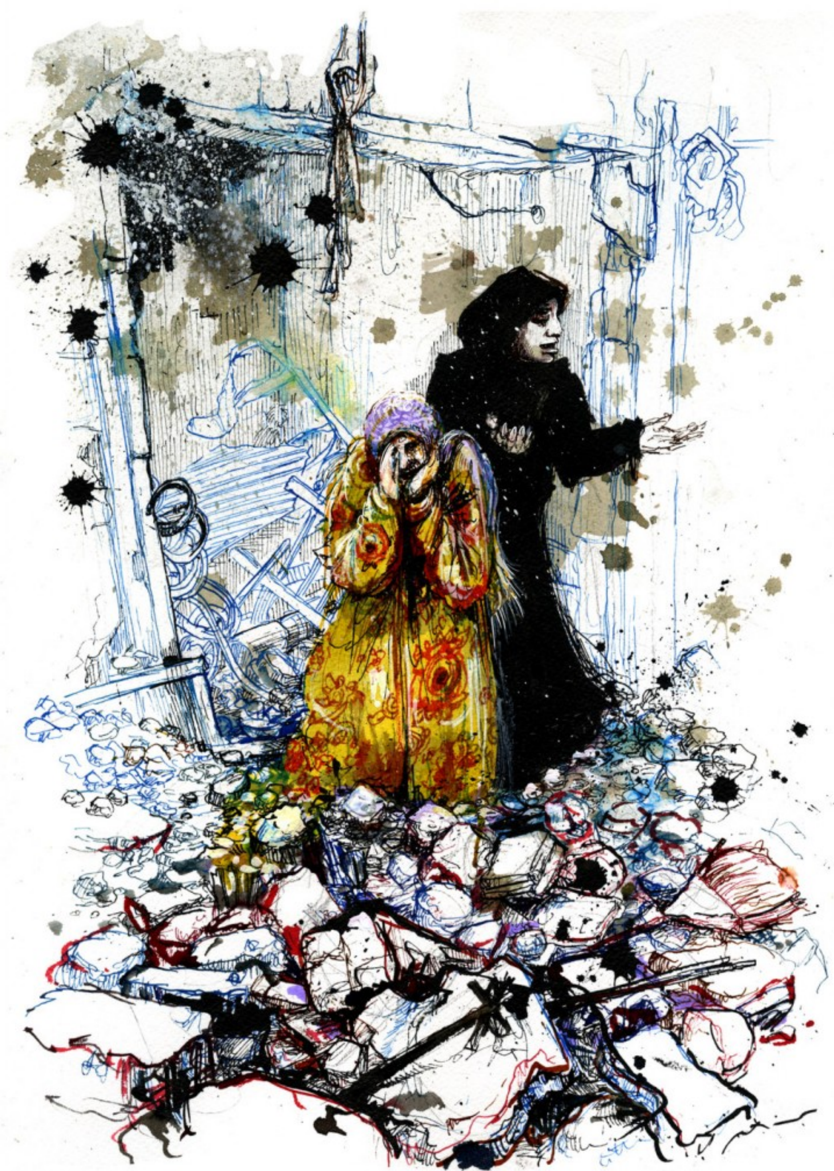
Illustration by Molly Crabapple