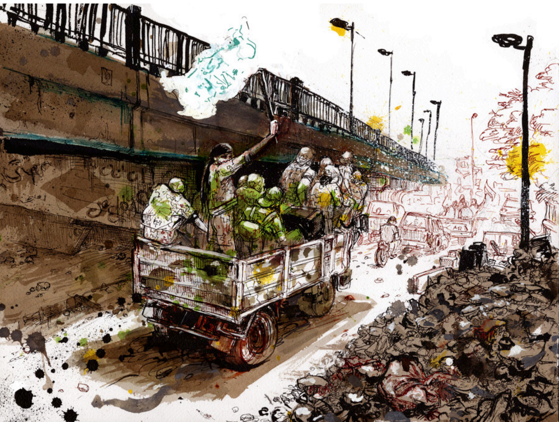
Fighters from the Islamist group Fastaqim Kama Umert.

This is the first time I've ever worked primarily from someone else's photos, and I always feel very through a glass darkly.