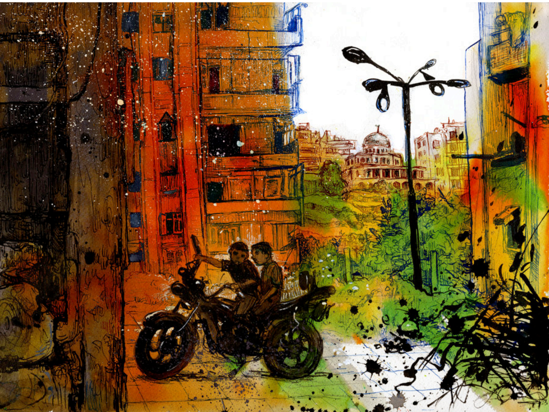
A scene from the Bustan Al-Qasr neighborhood of Aleppo. Illustration by Molly Crabapple

BY CORINNE SEGAL September 24, 2015 at 2:49 PM EST