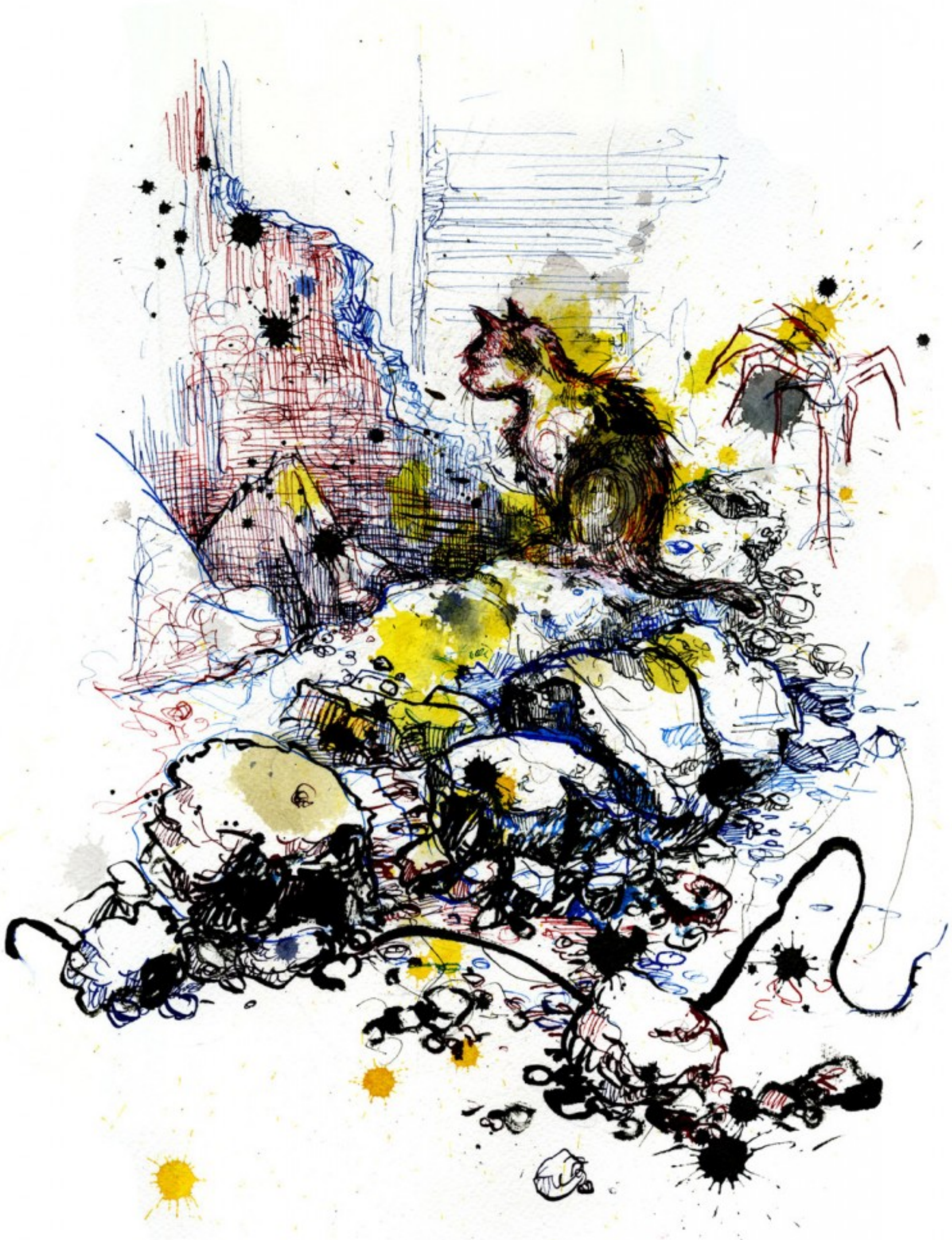
A scene from the Tallat Al-Zarazeer district in Aleppo. Illustration by Molly Crabapple