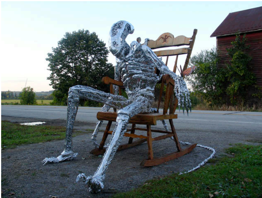
Monarch, 2008, mixed media sculpture, 8 x 12 x 4 feet

Opening reception Thursday, May 21 6-8pm