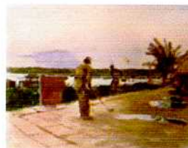
"Soldiers hitting golf balls into the Tigris at dusk from one of Saddam's palaces, Tikrit, Feb, 2004." Steve Mumford