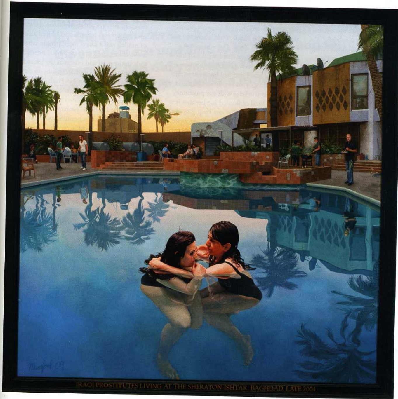
IRAQI PROSTITUTES LIVING AT THE SHERATON-ISHTAR BAGHDAD, LATE 2001