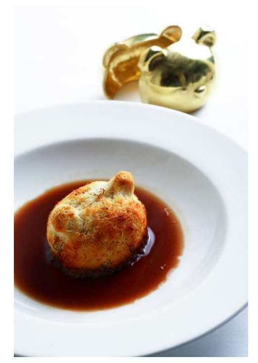
Bring Me The Head of... 2008 Changa, Istanbul

piece; for instance: "That guy made a double size of so and such sculpture and then put it on a truck and took for a ride in New York."