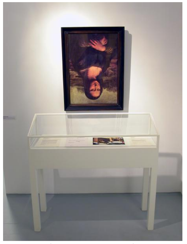
Mona Lisa Upside Down, 1996-present. Work-in-progress.