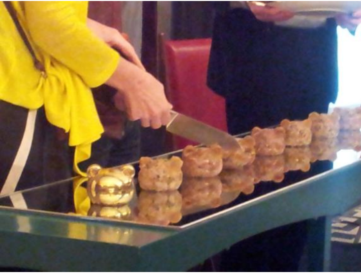
Bring Me The Head of... 2012 Capital m, Beijing

S: ...we're there, we think we've seen it, but what we've seen wasn't much, and what we felt was much more different than whatever we see on the video. To