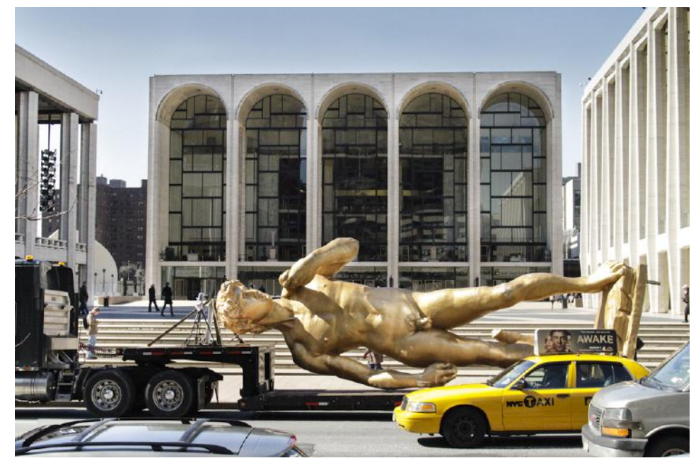
David (inspired by Michelangelo) 2012, New York

L: No. That's not even a term, "post-conceptualist."