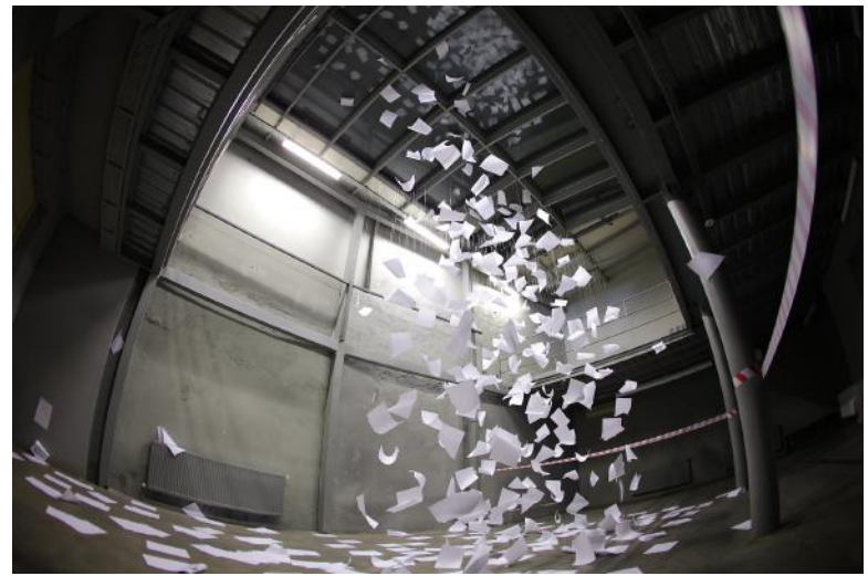
Sudden Gust of Wind 2008, Bilsar, Istanbul

with different structures or different forms; you're making forms out of these concepts or rules.