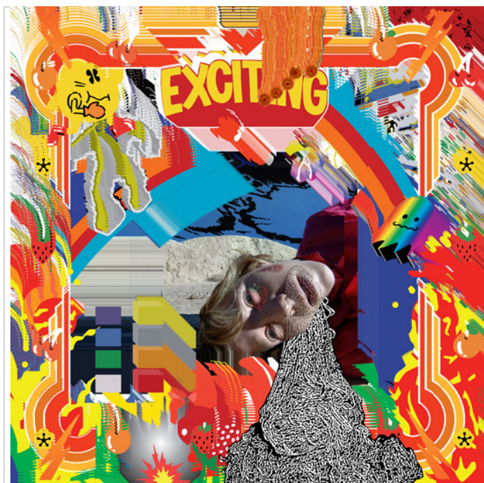
Kristin Lucas, SFRUIT, 2007. Light box, 8 x 8 in.

In my mind, I am in a shopping mall parking lot. I am framing a scene that I will fill with a cast of zombies. People and family vehicles move through the space of my palms. I am psyched. The temperature is ideal. There is no breeze, so it feels like indoors. It will be a night scene set in daylight. The location is any small or medium-sized city in the US or Canada. The location is a shopping mall parking lot. The location is the space between my palms. The location is the illusionary landscape of my mind.