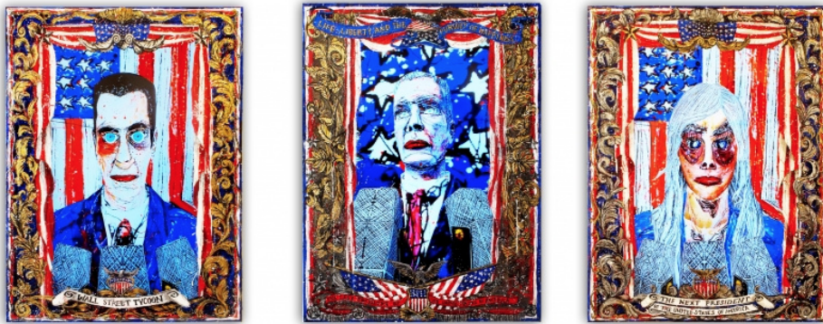
Federico Solmi, American Circus (Installation view) , 2014, 3 video paintings, acrylic paint on plexiglass, gold and silver leaf, video loop, time varies, 18 x 24 inches (each).

Richman Wall Street Tycoon (all 2014). Rendered with a combination of video game animation technology, acrylic paint, and gold and silver leaf on Plexiglas (these are objects as much as videos), the figures move in the stiff, staccato manner typical of video game characters. They stand against a background filled with an American flag, and before a bank of microphones, nodding their heads to acknowledge the cheers of an unseen crowd. Their faces are ghoul-like, complete with waxy-looking skin, dark bags under eyes that practically pop out of their heads, and curious crimson splashes that resemble splattered blood. The bright reds, whites, and blues that comprise the scene glow and pulse continuously.