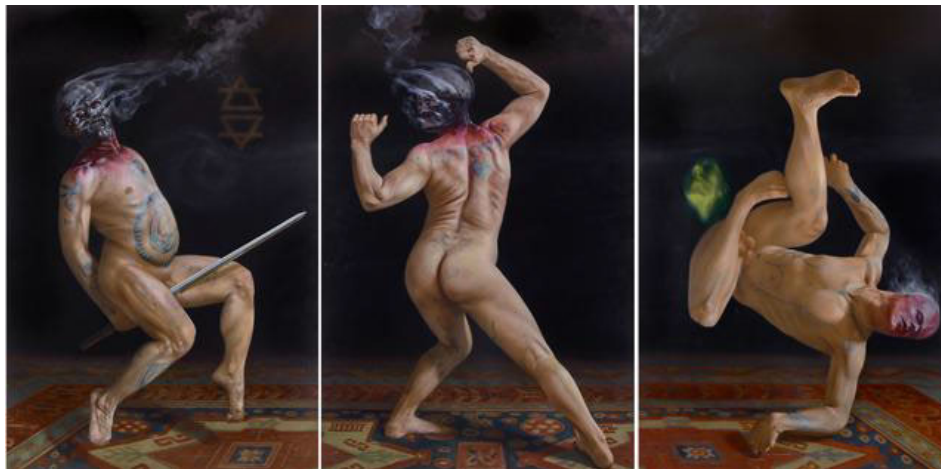
Icarus , 2016, triptych, oil on linen

Van Minnen's works project themes of sci-fi strangeness mixed with the technical skill of classical artistry. A triptych depicting a dancing, naked man with a burning skull is made even more off-putting by placing a spear between his thighs. Similarly, what look like tattooed human palms are transformed into new oddities when slick, neon eclipses—or gummies, as candy also seems to be a recurring theme—hover in front.