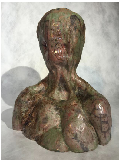
Enantiodromia, 2016, ceramic