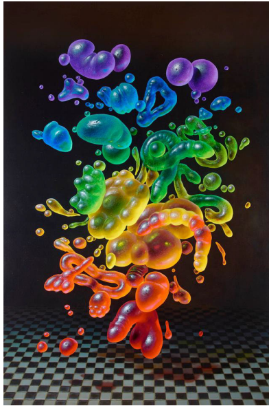
To Do, To Be, 2016, oil on linen