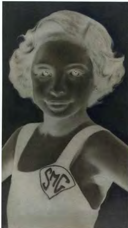
right: Anthony Goicolea (Brooklyn, NY) Mother I diptych , 2008 Chromogenic print 16 x 24 inches From the series Related