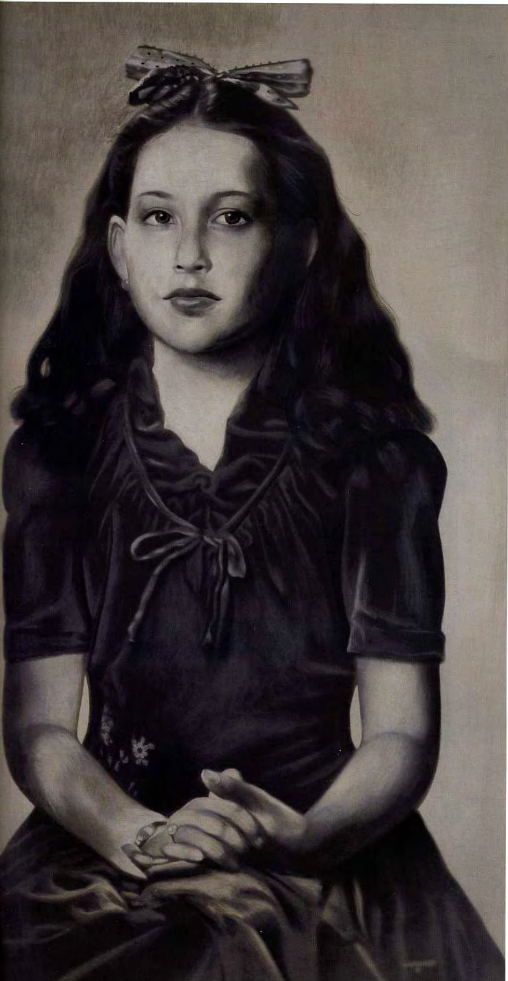
Anthony Goicolea (Brooklyn, NY) Aunt diptych , 2008 Chromogenic print, 24 x 16 inches From the series Related