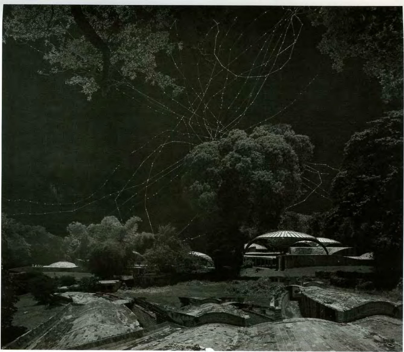
above: Anthony Goicolea (Brooklyn, NY) Day for Night , 2008 Chromogenic print with acrylic, ink and crayon 50 x 57 inches From the series Related