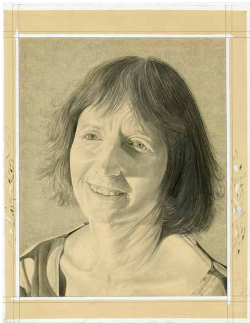
Portrait of the artist. Pencil on paper by Phong Bui.

ZAUSNER: It starts with sculpture. That's always the first thing that I make. I build the sculptures for what I want to do in the film. With the collages, sculptures, and film, everything is thought about at the same moment. I don't have all the sites in mind, exactly what I'm going to be doing with the sculptures in each site, but I know what kind of sculpture I need for filming: They're soft, they respond to the body, they're heavy, they're of a certain color, they have a certain skin, they have a certain kind of flexibility.