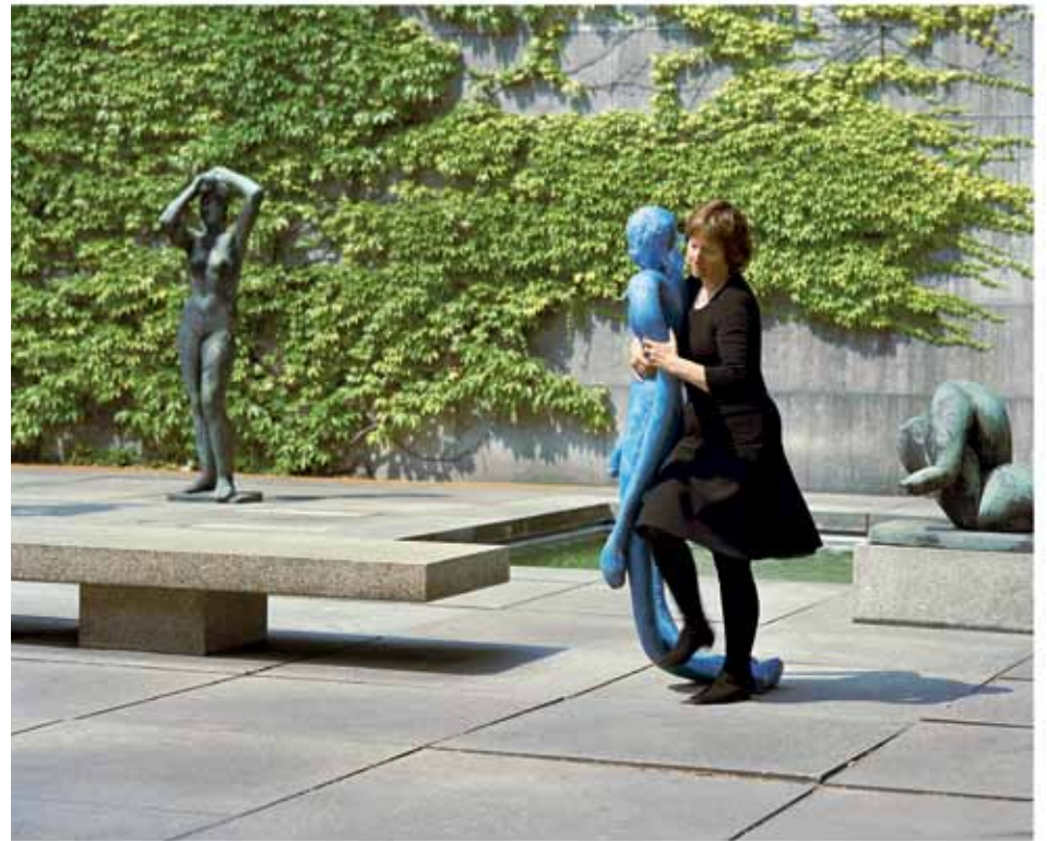
Neue Nationalgalerie sculpture garden, 2007. Courtesy the artist.

Baroque, Gothic, and Renaissance sculptures. Throughout the film, we see you carrying your figures around Berlin, taking them through train stations, amusement parks, through city streets. It's as if you're trying to find a place for art, a place for sculpture. This quest leads you eventually to a museum, a very traditional museum. At the end of the film, you leave the blue male figure lying on the floor of the Bode Museum. Then the last shot is of you carrying the female figure, disappearing into the distance along a wide avenue. Do you think you are trying to find a home for homeless art?