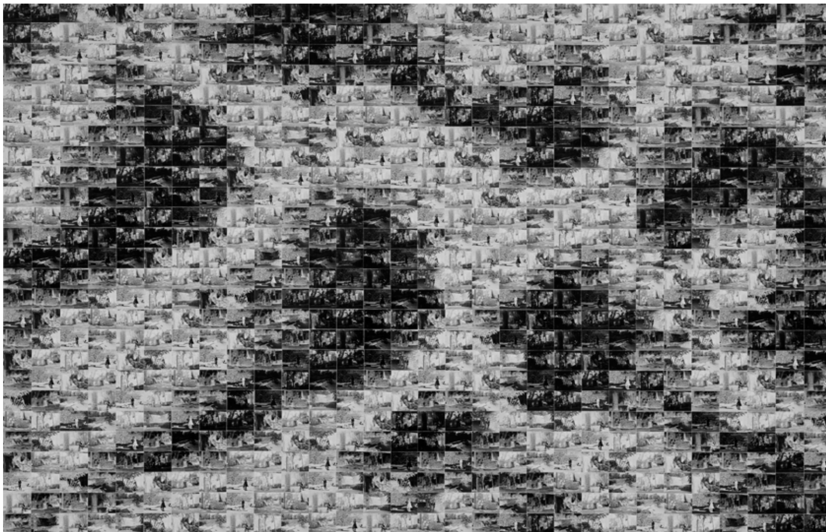
"A Conversation," 90 x 60", archival pigment print photo collage, 2012.