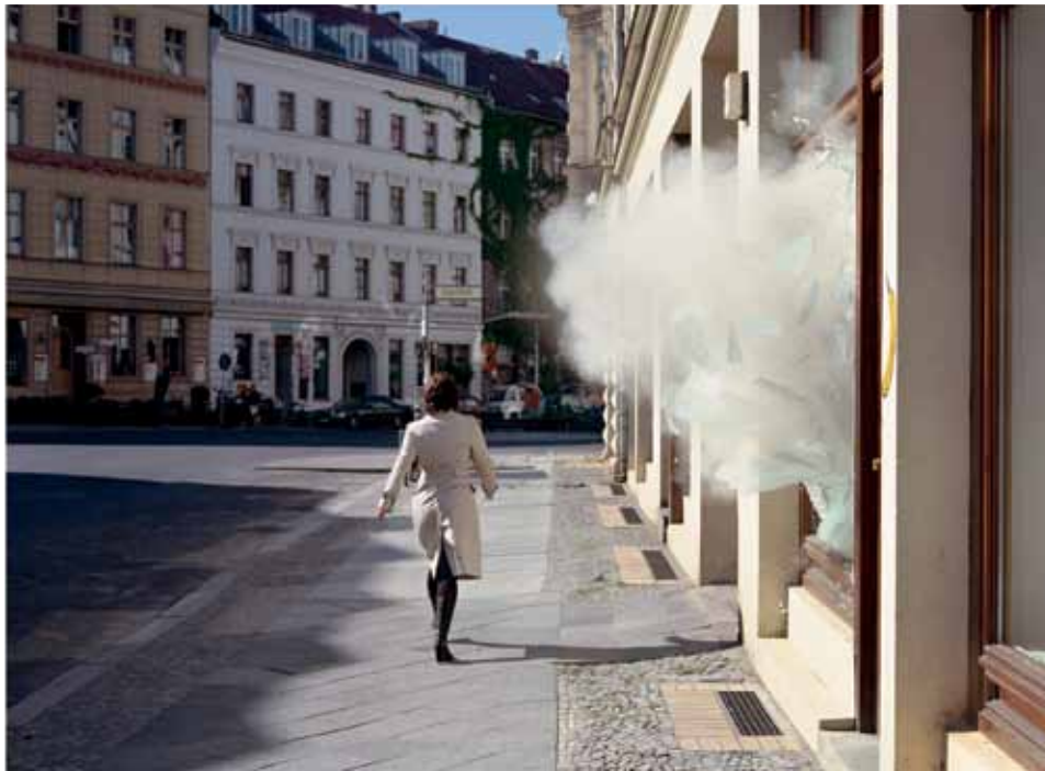
Explosion , 2007. Digital c-print.