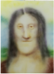
Austin Lee The la joconde 2015 flashe acrylic on board 48 x 36 inches