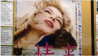
Holly Zausner L'Avventura Poster 2015 color photograph 22 x 39.5 inches edition of 5 + 2 AP