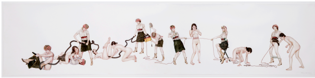
Monica Cook Naked and Officials

2012 ink on frosted mylar 15 x 66 inches