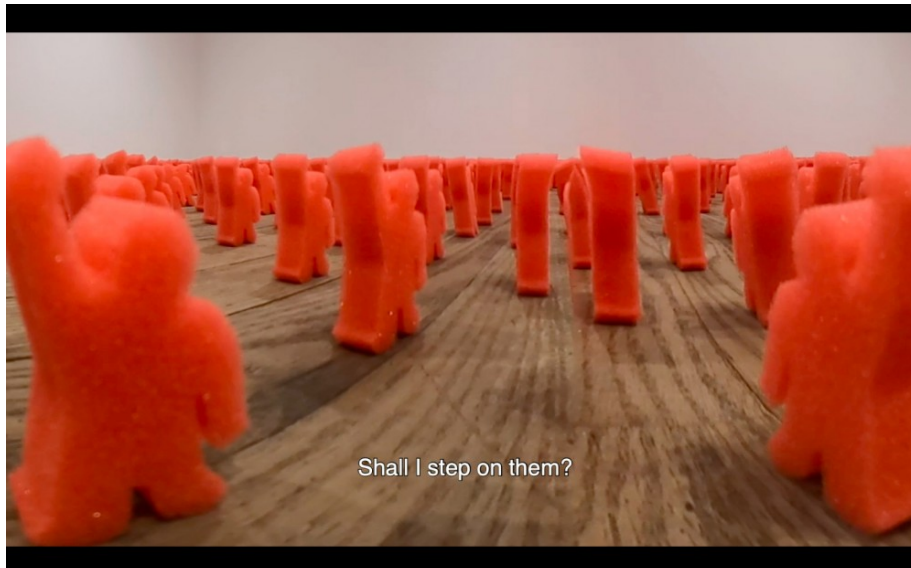
Fig. 2 Still from Left is Right Down is Up , by Serkan Özkaya and Deniz Tortum. 2020. Duration 2m 43s.