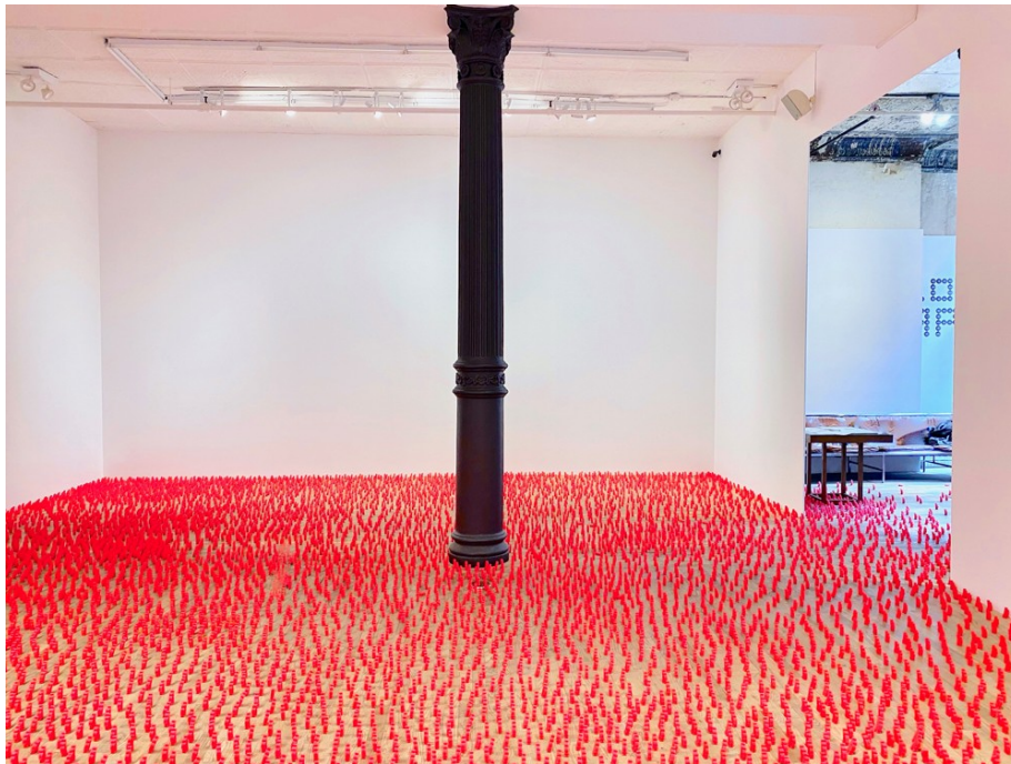
Fig. 1 Installation view of Left is Right, Down is Up at Postmasters Gallery, New York, 2020.

The exhibition Left is Right, Down is Up at Postmasters Gallery, New York, pairs Serkan Özkaya’s installation Proletarier Aller Länder (Workers of the World) FIG. 1 with a sound piece by Joseph Beuys. A multitude of near-identical small red foam figures blanket the gallery floor, a diminutive proletarier serenaded by the chanting voice of Beuys and two colleagues in a recording from 1968: ‘ Ja ja ja ja ja, nee nee nee nee nee ’. As visitors walk through the gallery, stepping on the work, the figures collapse under feet and spring back up once released, creating, according to the invitation, an ‘ambiguous viewing experience’. And yet the possibility of accessing this ‘experience’ was interrupted because of the COVID-19 pandemic. The show was installed as planned, but the gallery has been closed to visitors since then. In a statement titled ‘How to experience “Experience Art” in a pandemic – a modest proposal’, the gallery owner Magda Sawon writes; ‘The exhibition is now on pause, sitting still in a closed gallery’.