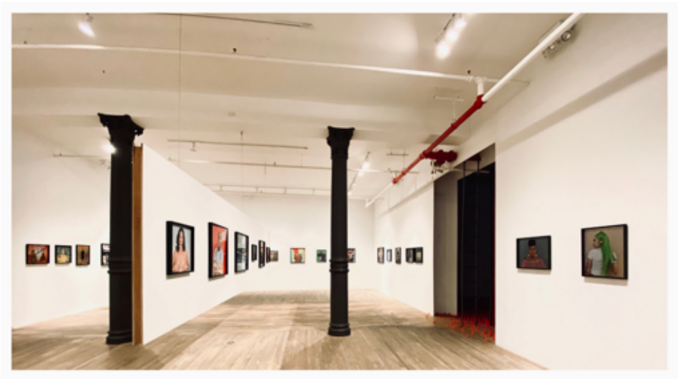
Ruben Natal-San Miguel, installation view

Taraneh Niakan, "Ruben Natal-San Miguel's 'Women R Beautiful' Exhibit," Musée Magazine, May 12, 2020 <a href="https://museemagazine.com/features/2020/5/12/review-ruben-natal-san-miguels-women-r-beautiful-exhibit">https://museemagazine.com/features/2020/5/12/review-ruben-natal-san-miguels-women-r-beautiful-exhibit</a>