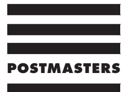
3. NSFW.