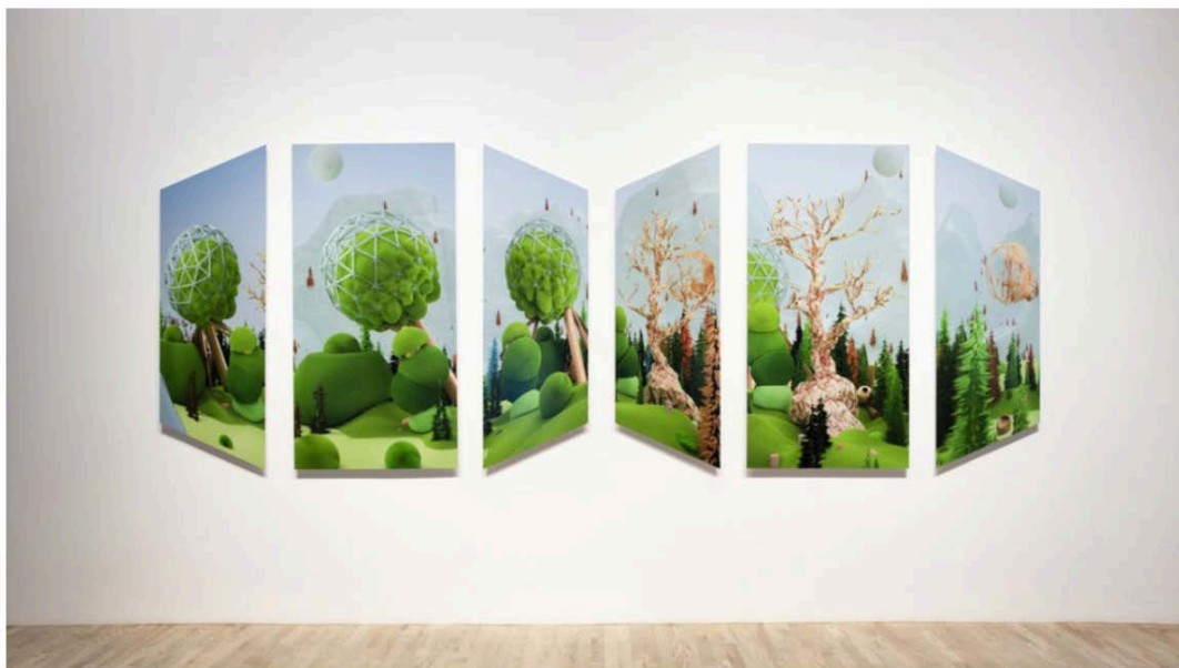
Glamour Modeling

Postmasters Gallery is pleased to announce Glamour Modeling – our first solo exhibition with Toronto-based new media artist Alex McLeod. Born in 1984, McLeod is an artist concerned with simulation and the transition of matter. His digitally rendered characters and environments have an air of uncanny familiarity to anyone who's ever virtually set foot inside a video game.