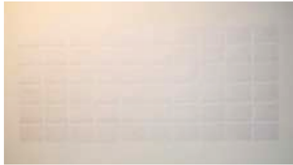
Passing Clouds (Over Signal Hill, March 27, 2008) colored pencil on paper 51 x 144 inches, 60 pieces unique