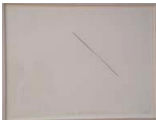
Shadow of a Shadow (skull) 2009 watercolor on paper 225 x 30 inches (25 x 33 inches framed) unique