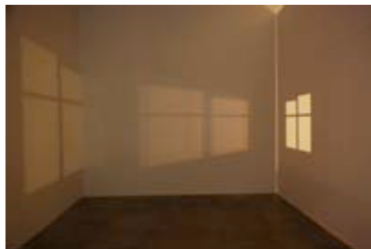
Paper Moon (Studio Wall at Night) 2009 mixed media dimensions variable unique

This work precisely re-creates the shadows cast on the studio wall by exterior streetlights and passing cars.