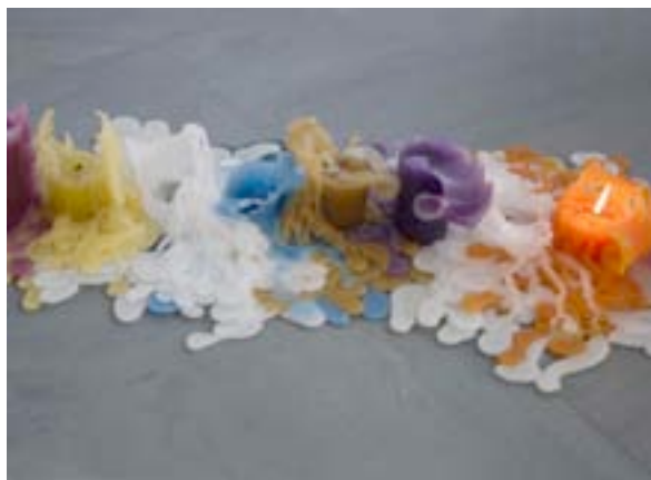
366 (Emily Dickinson's Miraculous Year) 2009 366 wax candles 20.5 feet diameter unique

This work is based on the year 1862, Emily Dickinson's annus mirabilis , when she wrote an amazing 366 poems in 365 days. It is a real-time memorial to that year, which burns for exactly one year. The sculpture is comprised of 366 individual candles arranged in linear sequence, each of which burns for 24 hours. The color of each candle matches a color mentioned in the corresponding poem; poems in which no color is mentioned are made out of natural paraffin. On each day of the exhibition a new candle is ignited from the previous candle as it burns out.