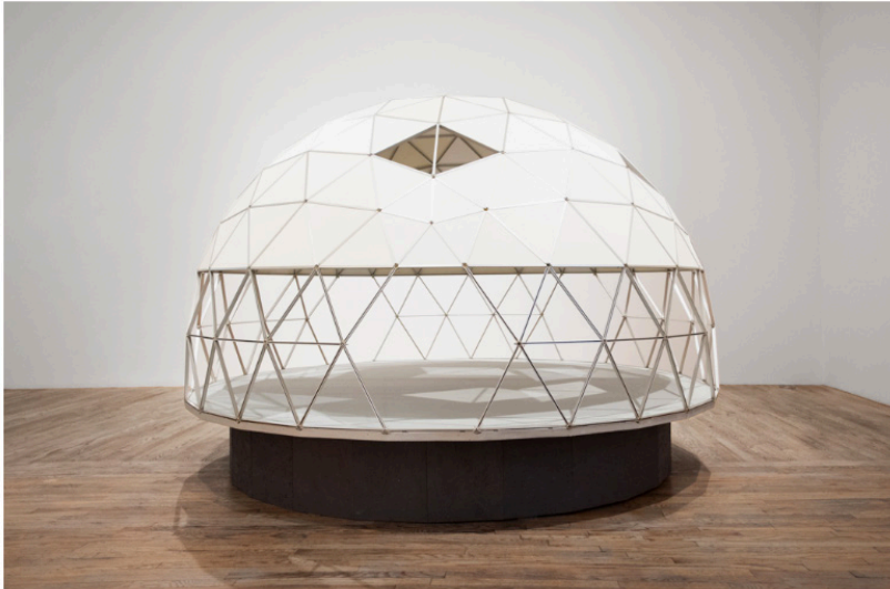
Bernard Kirschenbaum, Model Dome Cluster (1 Dome) , 1966, masonite, plexiglass, aluminum, installation view.

three panels in intense color—red, green, and blue, and the edges were lights, on a platform. And from then on, for him, it was sculpture. '