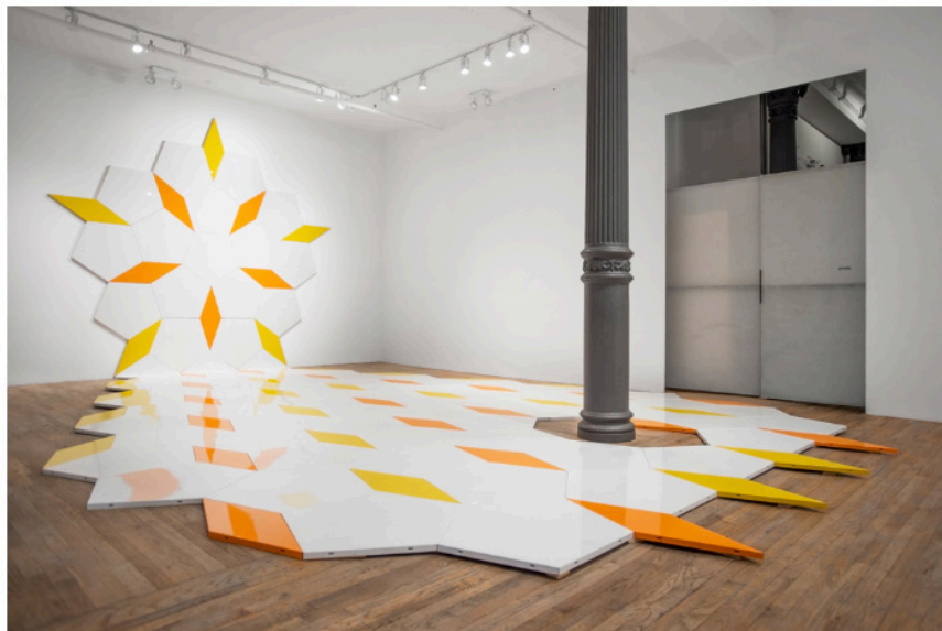
Bernard Kirschenbaum, Two Element City , 1969, painted steel, white, orange, and yellow, installation view.

Copyright 2018, Art Media ARTNEWS, llc. 110 Greene Street, 2nd Fl., New York, N.Y. 10012. All rights reserved.