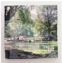
Didactics (FriezeDF) 2017 digital print on aluminum 20 x 20 inches (50.8 x 50.8 cm) edition of 2