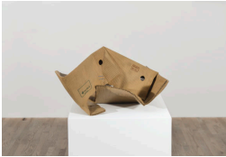
Untitled (Avocado Box) 2016 carved wood and paint 13 x 25 x 17 inches (33 x 63.5 x 43.2 cm)