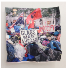
Didactics (ReOccupy) 2017 digital print on aluminum 20 x 20 inches (50.8 x 50.8 cm) edition of 2