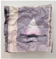
Didactics (Ultra) 2017 digital print on aluminum 20 x 20 inches (50.8 x 50.8 cm) edition of 2