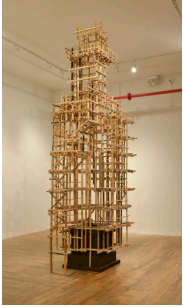
The Phantom of Liberty 2017 wood, string, latex paint, hardware 12 x 5.5 x 4 feet (3.6 x 1.7 x 1.2 m)