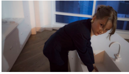
Staging (sink) 2017 digital C-print 8 x 14 inches (20.3 x 35.6 cm) edition of 3