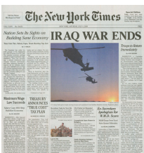
New York Times 2008 newspaper 23 x 12.5 inches Copies to purchase are available here: http://www.theconnection.com/yesmen/yesmen_index.cfm