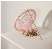
A Dreamcatcher of Sorts 2017 hair net, bamboo clothespins, dowel, plastic air dryer 11 x 8 x 11 inches (28 x 20 x 28 cm)