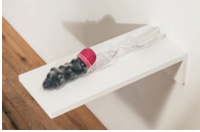
Mouthfull 2017 plastic cap, glass marbles, non-lubricated condom, salad tongs 9 x 2 x 2 inches (25 x 5 x 5 cm)