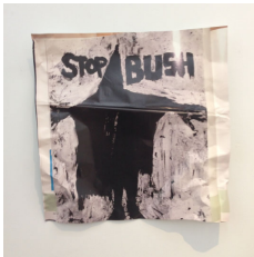
Didactics (Serra) 2017 digital print on aluminum 20 x 20 inches (50.8 x 50.8 cm) edition of 2