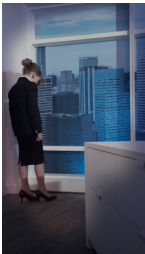
Staging (view) 2017 digital C-print 14 x 8 inches (35.6 x 20.3 cm) edition of 3