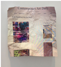
Didactics (Contemporary Art Daily) 2017 digital print on aluminum 20 x 20 inches (50.8 x 50.8 cm) edition of 2