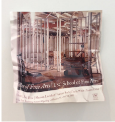
Didactics (Roski) 2017 digital print on aluminum 20 x 20 inches (50.8 x 50.8 cm) edition of 2