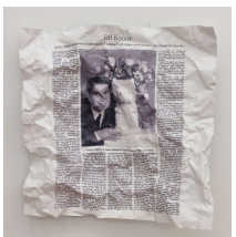
Didactics (McEwen) 2017 digital print on aluminum 20 x 20 inches (50.8 x 50.8 cm) edition of 2