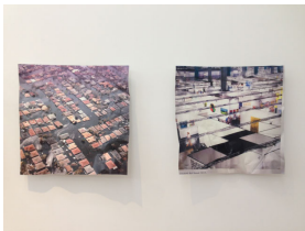
Didactics (Katrina) , left; Didactics (Basel) , right 2017 digital print on aluminum 20 x 20 inches (50.8 x 50.8 cm), each edition of 2