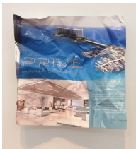
Didactics (Privé) 2017 digital print on aluminum 20 x 20 inches (50.8 x 50.8 cm) edition of 2