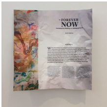
Didactics (Hoptman) 2017 digital print on aluminum 20 x 20 inches (50.8 x 50.8 cm) edition of 2