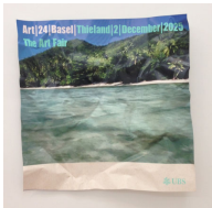
Didactics (Thieland) 2017 digital print on aluminum 20 x 20 inches (50.8 x 50.8 cm) edition of 2