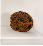
One is Usually Bigger Than the Other 2017 neck pillow, wig cap, plastic cable ties 10 x 10 x 4 inches (25 x 25 x 10 cm)

postmastersart.com postmasters@thing.net