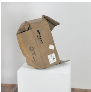
Untitled (Amazon Box) 2016 carved wood and paint 23 x 23 x 17 inches (58.4 x 58.4 x 43.2 cm)