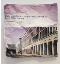
Didactics (Gagosian and Zwiner) 2017 digital print on aluminum 20 x 20 inches (50.8 x 50.8 cm) edition of 2