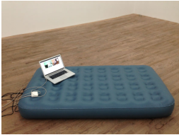
No Fun 2010 single-channel video installation, 15 min 34 sec dimensions variable edition of 3 + AP