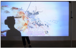
Scrubbing 1, Maquette 2017 virtual reality installation dimensions variable