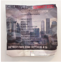
Didactics (#CTSUMMIT2022) 2017 digital print on aluminum 20 x 20 inches (50.8 x 50.8 cm) edition of 2