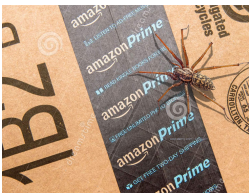
The Spiders for Change Fund: donate 1 dollar to anonymously release a wolf spider in the gallery to be photographed by an attendee for $100 towards cancer research 2017 To donate: https://www.etsy.com/listing/537314413/the-spiders-for-change-fund-donate-1