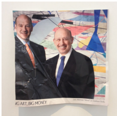
Didactics (Blankfein) 2017 digital print on aluminum 20 x 20 inches (50.8 x 50.8 cm) edition of 2