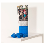
Bad Dog 2017 nitrile glove, New York Magazine (Issue May 1-14, 2017), glass marbles 5 x 14 x 6 inches (13 x 35 x 15 cm)