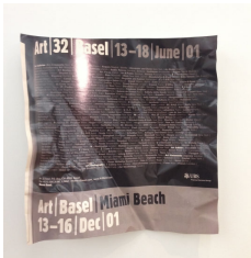
Didactics (Canceled) 2017 digital print on aluminum 20 x 20 inches (50.8 x 50.8 cm) edition of 2