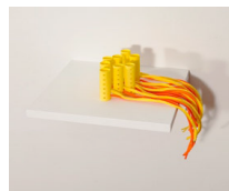
Fingertips Pt. 3 (or Project Buildings) 2017 plastic rollers, shoelaces 5 x 13 x 3 inches (13 x 33 x 8 cm)