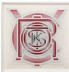
KAKISTOCRACY, 2015 enamel on mylar 23.5 x 23.5 inches (60 x 60 cm)