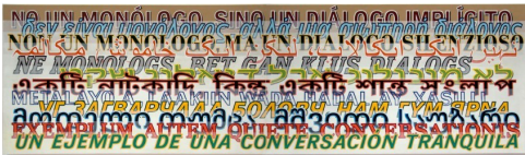
MONOLOGO (TRANSLATION), 2015 enamel on PVC panel 27 x 96 inches (68.5 x 244 cm)