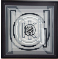
SMOKING GUN, 2017 enamel on mylar 23.5 x 23.5 inches (60 x 60 cm)