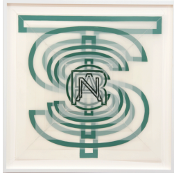
NARCISSIST, 2019 enamel on mylar 23.5 x 23.5 inches (60 x 60 cm)