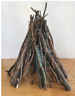
BONFIRE, 2017 enamel and gold leaf on wood 66 x 54 x 54 inches (168 x 137 x 137 cm)