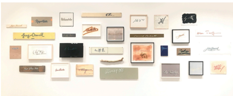
FORGERY, 2015-2019 enamel and gold leaf on mixed media dimensions variable