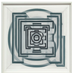
ORIENTIERUNG, 2015 enamel on mylar 21 x 21 inches (53.5 x 53.5 cm)