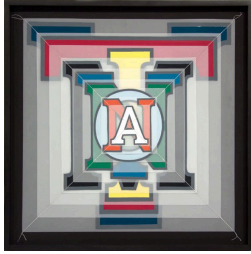
ANONYMITY, 2017 enamel on mylar 21 x 21 inches (53.5 x 53.5 cm)