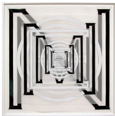
PHENOMENON, 2015 enamel on mylar 39 X 39 inches (99.5 x 99.5 cm)