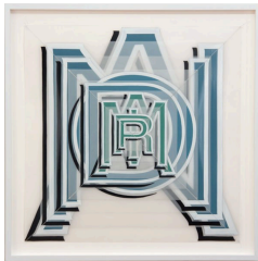
PRIMA DONNA, 2017 enamel on mylar 23.5 x 23.5 inches (60 x 60 cm)