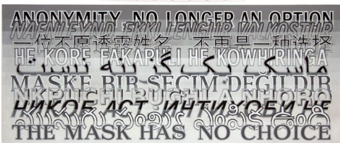
ANONYMITY (TRANSLATION), 2015 enamel on PVC panel 20.5 x 48 inches (51 x 122 cm)