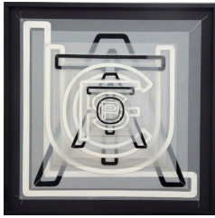
POST FACTUAL, 2017 enamel on mylar 23.5 x 23.5 inches (60 x 60 cm)