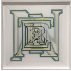
CHARLATAN, 2019 enamel on mylar 23.5 x 23.5 inches (60 x 60 cm)