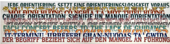
ORIENTIERUNG (TRANSLATION), 2015 enamel on PVC panel 23.5 x 96 inches (59.5 x 244 cm)